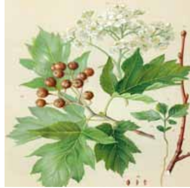
The picture above shows the leaves, flowers and fruit of the Wild Service Tree

The wild service tree, sometimes known as the chequers tree is a medium sized tree growing 15-25m tall with sweeping branches and a bark that is smooth and grey but flaky.